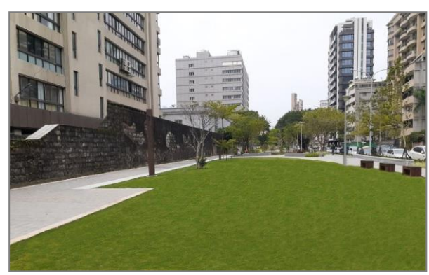
Renovation to the Taipei Prison Memorial Park.

AUGUST 15TH 2020 – THE 75TH ANNIVERSARY OF VJ DAY AND THE END OF WORLD WAR II