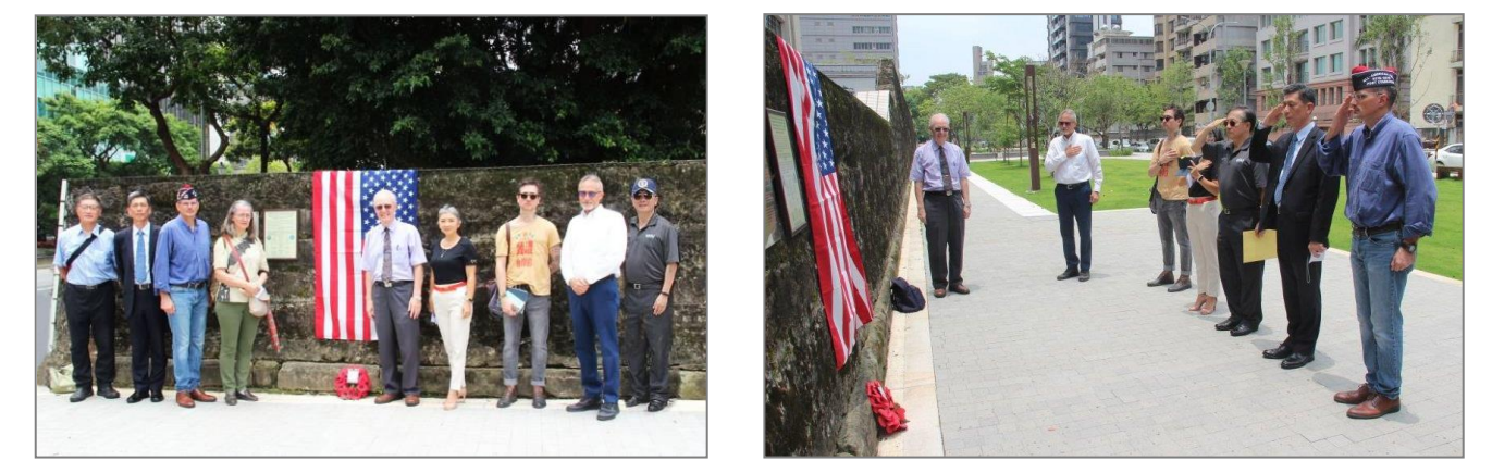
Gathering to remember those who served and died. / Veterans salute during the playing of the national anthem.

The gathering was small due to late notice, but it was one of the nicest and most sincere events commemorating the day that we have had. Our thanks to all who participated in the event, and hopefully many more will join us next year.