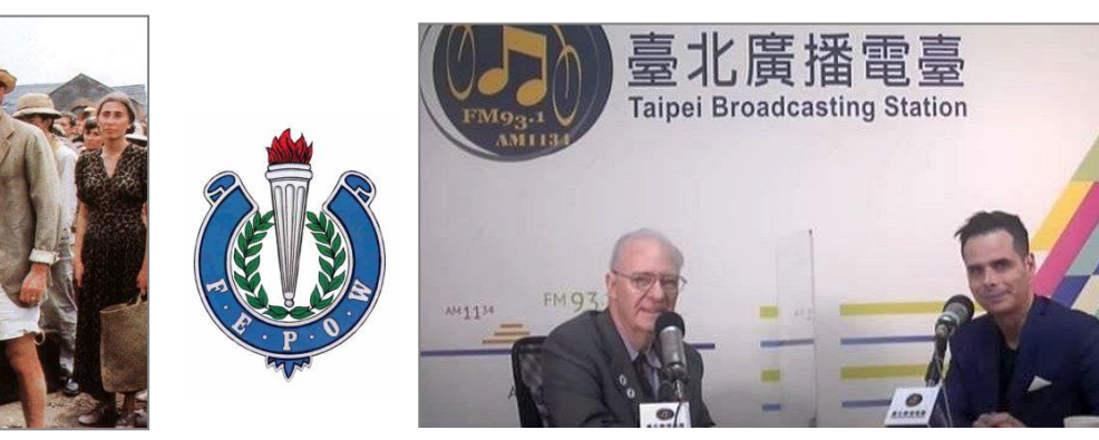
POW Radio Interview goes worldwide on YouTube.

"We need to remember that the soil we stand on, the air that we breathe and the life we live is FREE - because people who went before us gave up their freedom to win ours!