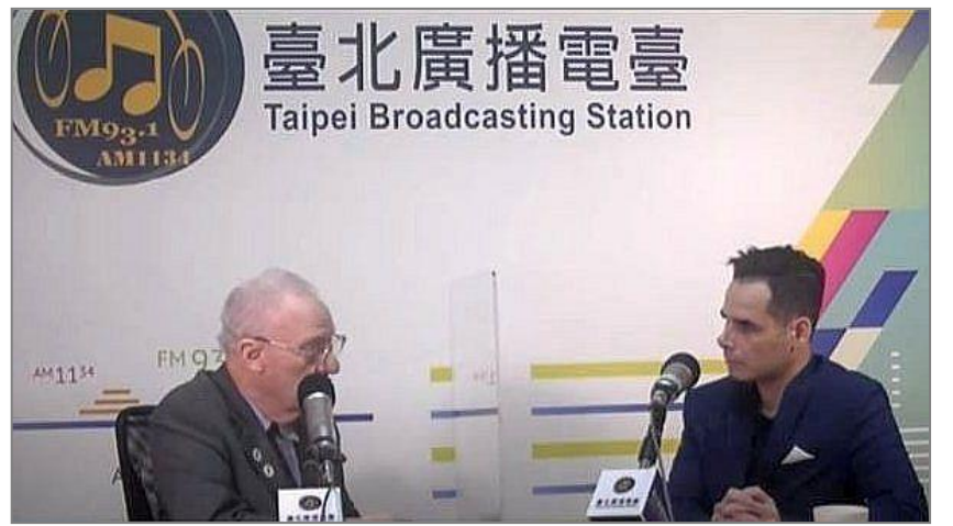
Answering questions and talking about the Taiwan POWs.