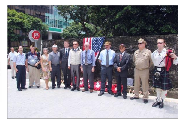
Taipei Prison Wall Memorial Service - June 13th.