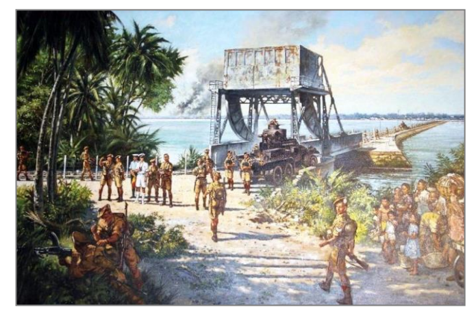
The 2nd Btn. Argylls crossing the causeway.

I was not aware that he was one of the famous pipers who played the Argylls across the causeway, and as he later became a POW in Taiwan, I looked into his story further.