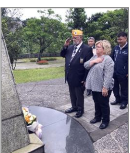
Visiting the museum POW display, the memorial wall, with the VAC hosts and paying tribute at the memorial.