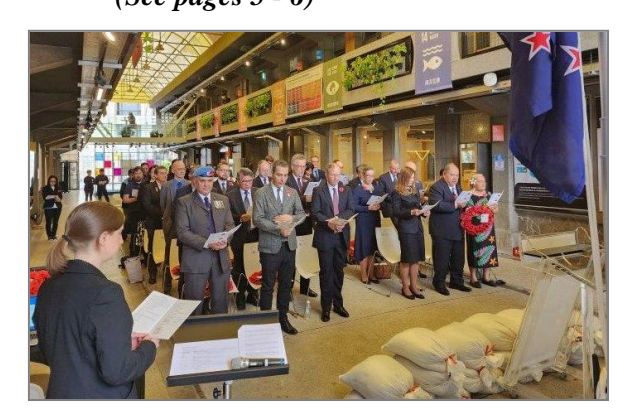
ANZAC Day celebrated - April 25th.