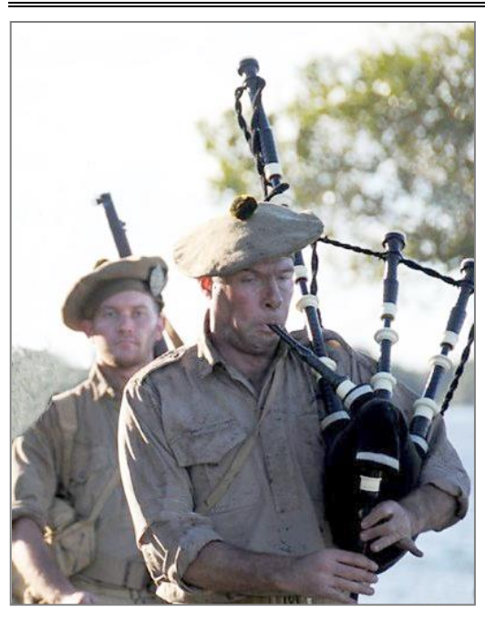
A Tale of Two Pipers . . . (See pages 5 - 6)